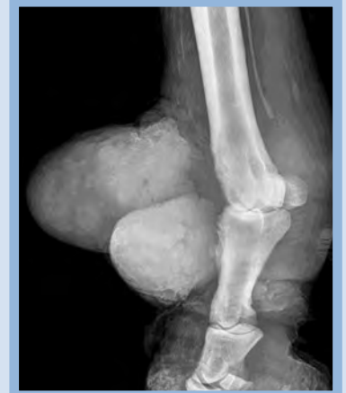
The X-ray of Phil's growth

the while. This big boy is up for adoption and is a favorite among our volunteers.