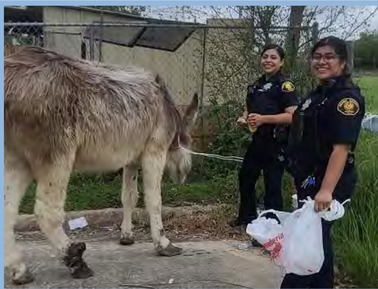
Phil the Mammoth was picked up by Harris County Constable Pct. 3 in April when he was found rummaging through trash. You can see the softball sized growth on his back right foot in this picture.

Phil lucked out and the precinct called up TMR. A wellness exam was done by one of our veterinarians and a biopsy showed the growth was not cancerous but proud flesh. Proud flesh is the result in the improper healing of a superficial wound. These types of growths are very