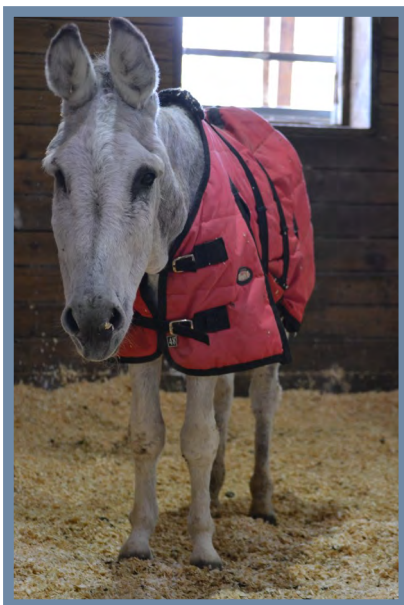
Jerry, the First Donkey

We offer these gracious animals a second chance at life, nurture their recovery, and ensure their safe transition to loving homes. Our expansive 200-acre sanctuary serves as a testament to our dedication, managed by a team whose passion for equine welfare knows no bounds.