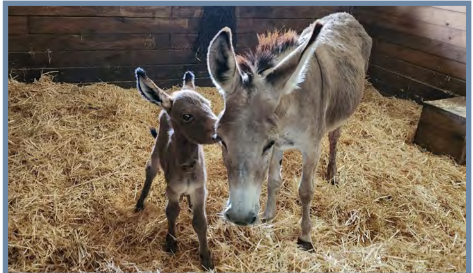
Puddin' giving Aster a kiss on the cheek in TMR's Medical Barn

Aster is believed to be a very young first time mother. That, paired with the malnourished and parasitic conditions she was rescued from, left Puddin' with a birth defect. Puddin' showed us her playful spunky self on the days we were able to spend together. She will be missed and her time at TMR was cherished by all that knew her.