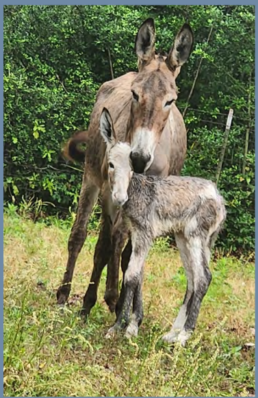
Lilac and Stormy (1 day old)

Lilac was at least 7 months pregnant when she was rescued last February. She made the 7 hour journey with 9 other donkeys to TMR Rescue and had her baby, named Stormy, on May 10 th . Stormy and Lilac have been recently adopted and are going to be kept together as a bonded pair. They will be forever safe and never have to be in fear again.