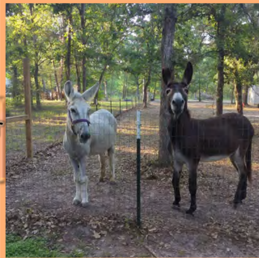
Ernie and Arnold found forever homes in 2023

Lilac was at least 7 months pregnant when she was rescued last February. She made the 7 hour journey with 9 other donkeys to TMR Rescue and had her baby, named Stormy, on May 10 th . Stormy and Lilac have been recently adopted and are going to be kept together as a bonded pair. They will be forever safe and never have to be in fear again.