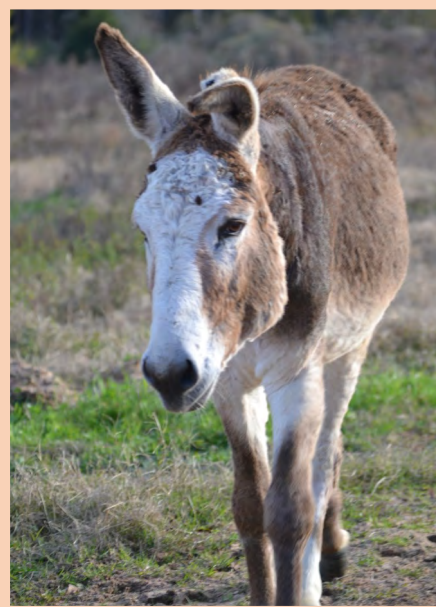
Pictured: Rescued Kill Pen Burro now named Floppy

The arrival of the May herd was sponsored, meaning the cost of saving the donkeys from the kill pen and transport was completely covered.