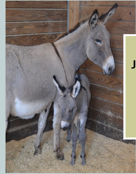
Juliette & Olive

Valerie — This sweet girl required immediate farrier work. Her "slippers" were trimmed and she is now up for adoption, awaiting the perfect home!