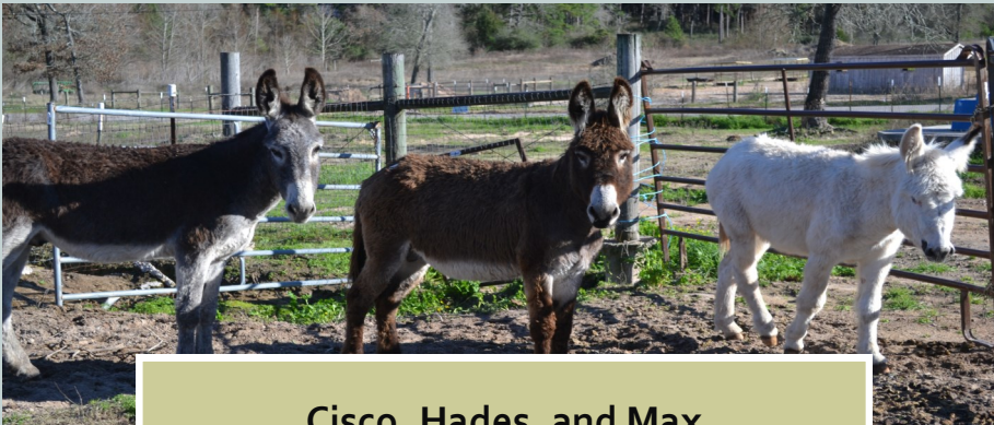
Cisco, Hades, and Max

In February, another organization reached out to TMR Rescue to help rescue a few kill pen animals.